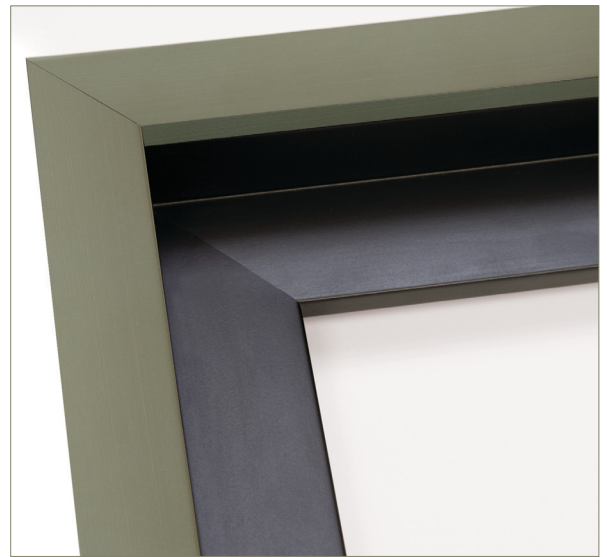
Shown: Apex 83703 paired with floater 83541