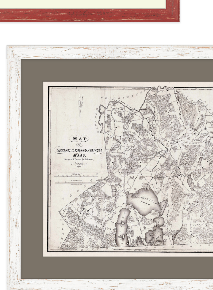
The art of cartography is also handsomely displayed using ▷ Côte d'Azur for its simple, provincial style. 1831 Map of Middleborough, etching in 84163 (white)